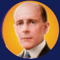
Rtn. Paul Harris FOUNDER OF ROTARY